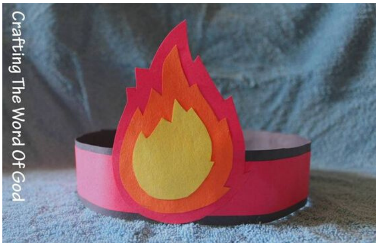
Crafting The Word Of God